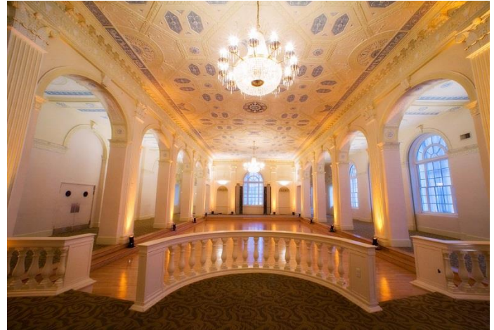
The Imperial Ballroom

The Biltmore, located in midtown Atlanta, is a perfect venue for corporate celebrations, weddings, and association meetings offering event attendees a uniquely elegant experience.