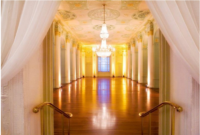
The Georgian Ballroom