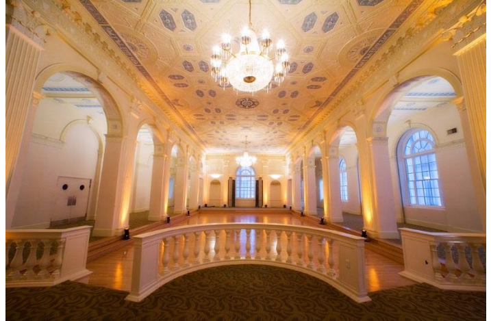
The Imperial Ballroom

The Biltmore, located in midtown Atlanta, is a perfect venue for corporate celebrations, weddings, and association meetings offering event attendees a uniquely elegant experience.