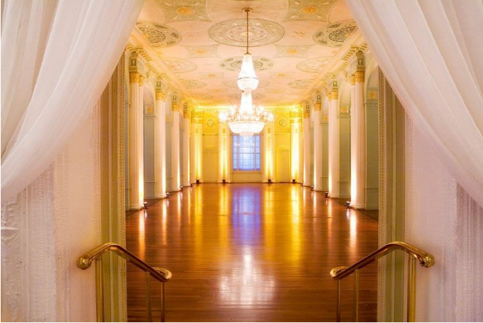
The Georgian Ballroom