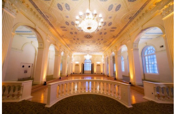
The Imperial Ballroom

The Biltmore, located in midtown Atlanta, is a perfect venue for corporate celebrations, weddings, and association meetings offering event attendees a uniquely elegant experience.